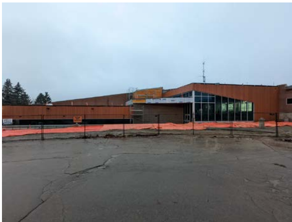
Exterior: View north (south entrance from Hardy Ave.)