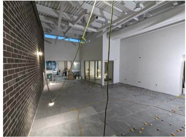
Interior: View within the Lower Lobby