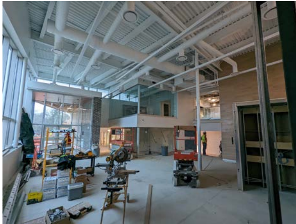
Interior: View within the Main Lobby