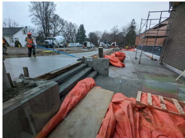
Exterior: View west from south entrance