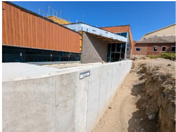
Exterior: View towards the south entrance