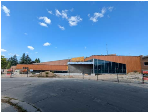
Exterior: View towards the north (south entrance from Hardy Ave.)

Public access to the Health Club has been reinstated for the beginning of September, while the adjacent Health Club washroom and sauna area is temporarily closed off as work continues; demolition work appears complete, and the finishing work has commenced.