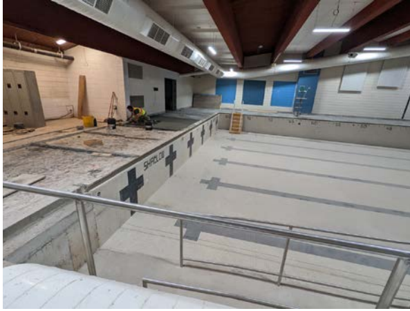
Interior: Kinsmen Pool work in progress