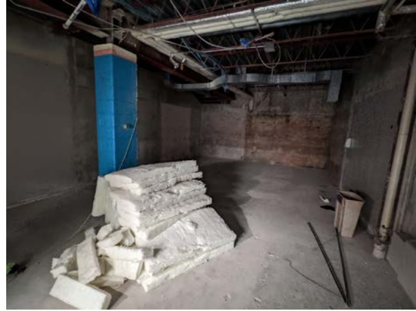
Interior: Health Club renovated area in progress