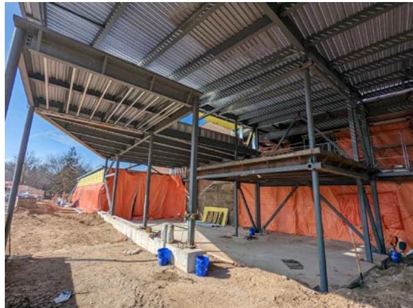
Interior: View towards the main entry and lobby area