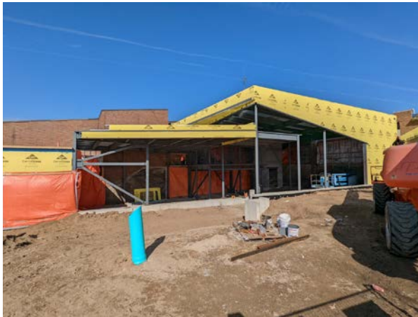
Exterior: View towards the north (South Entry from Hardy Ave.)

As work continues into March, further progress with the exterior wall construction and interior areas of the accessible change room and main lobby should be observed.