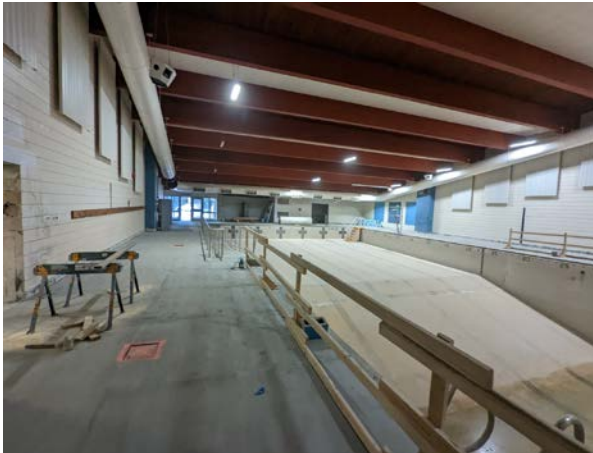
Interior: view towards the west (within Kinsmen Pool)