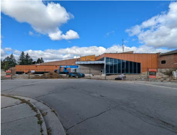
Exterior: View towards the north (south entrance from Hardy Ave.)