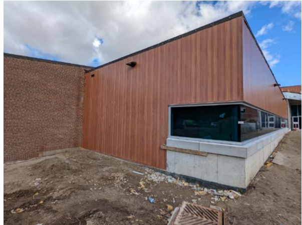
Exterior: West elevation (new addition)