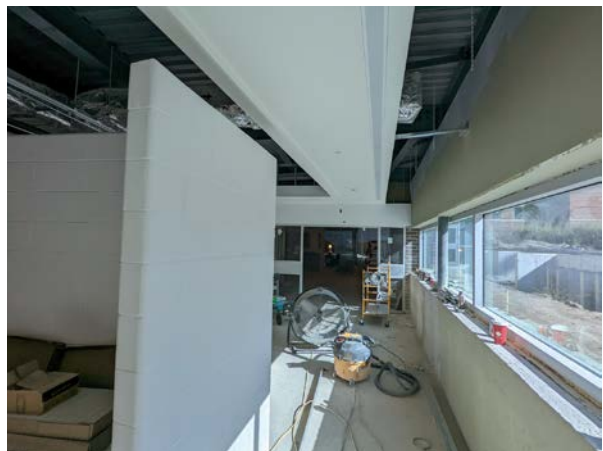
Interior: View towards the east / change room entry (within Accessible/Family Change Room)