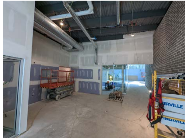
Interior: view towards the east (within Lower Lobby)